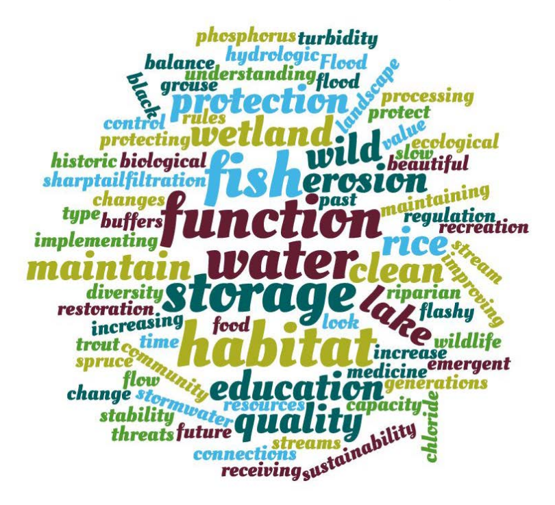
Figure 5. Word cloud depicting the diversity of responses to the question, "what does wetland & lake management mean to you?"

The definition of wetland & lake management can mean different things to different people depending on their objectives and goals. To illustrate the diversity of viewpoints, at the beginning of the Wetland & Lake meeting we asked wetland & lake experts and Advisory Committee members to provide us with their definition of what wetland & lake management means to them, which was assembled to create a word cloud (Figure 5).