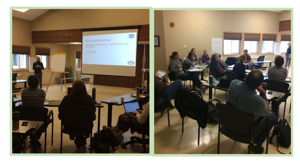
Figure 6. Photos from the Wetland & Lake Meeting held October 2<sup>nd</sup>, 2019.

A diverse group of wetland & lake experts plus the Nemadji 1W1P Advisory Committee gathered to provide input on the compiled issues list. The group agreed on a final list of 6 issue statements (Table 1) and were also provided the opportunity to add additional issues.