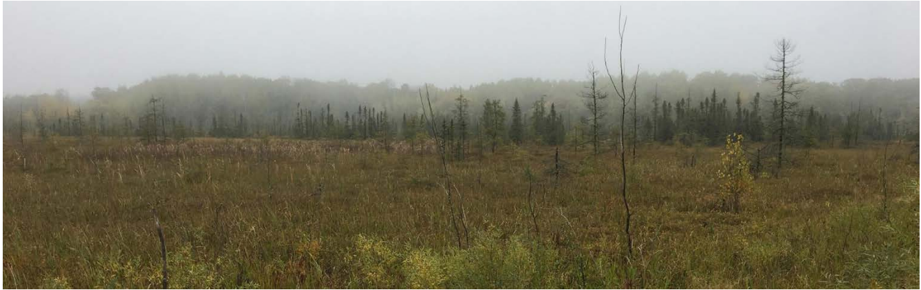
Figure 2. Wetland near Lac La Belle.

the lost wetlands are restorable. More data is needed to help us understand how well our wetlands are functioning.