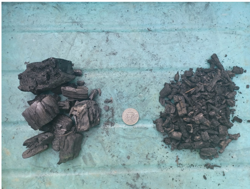
Biochar from 1" dia. brush