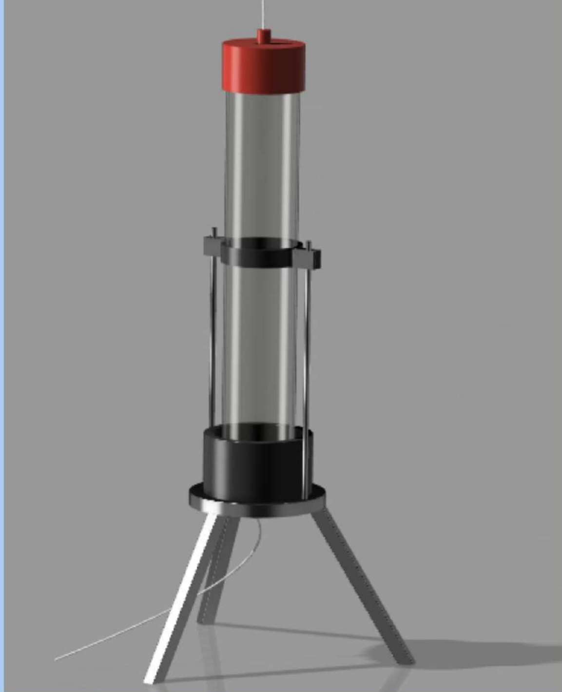
CHROMATOGRAPHY COLUMN STAND