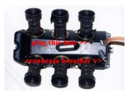
[click on any image for a larger view]

This page is to help clarify what to do with the No. 6 hoses after removal of the smog equipment on California bikes. Several people (myself included) had very poor running if the No. 6 line was connected to the airbox. To quote the relevant portions of the LaMonster instructions: