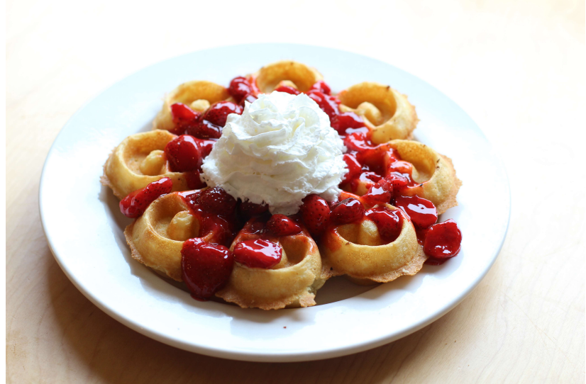
BELGIAN WAFFLE WITH STRAWBERRIES

BELGIAN WAFFLE WITH ..... $8.39 STRAWBERRIES OR BLUEBERRIES