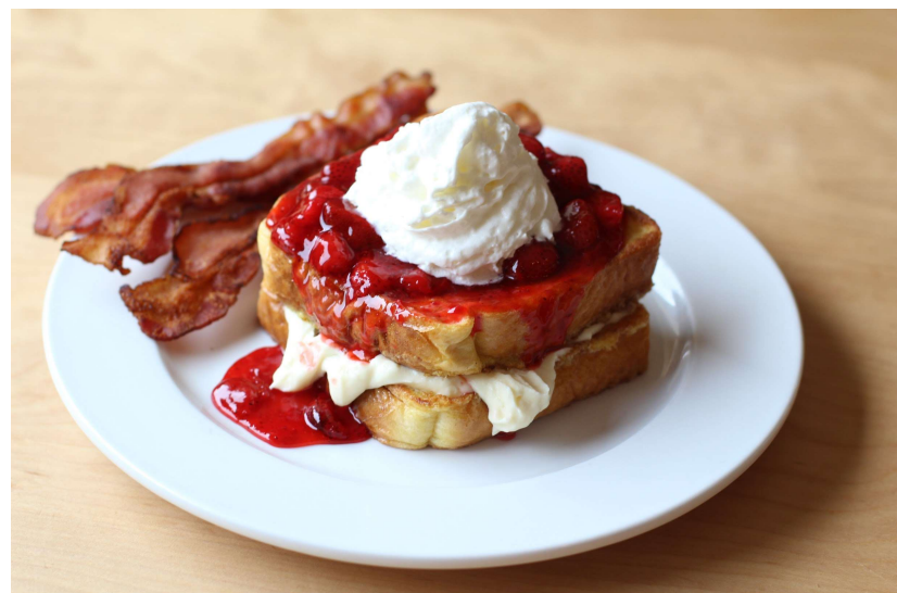
STUFFED FRENCH TOAST