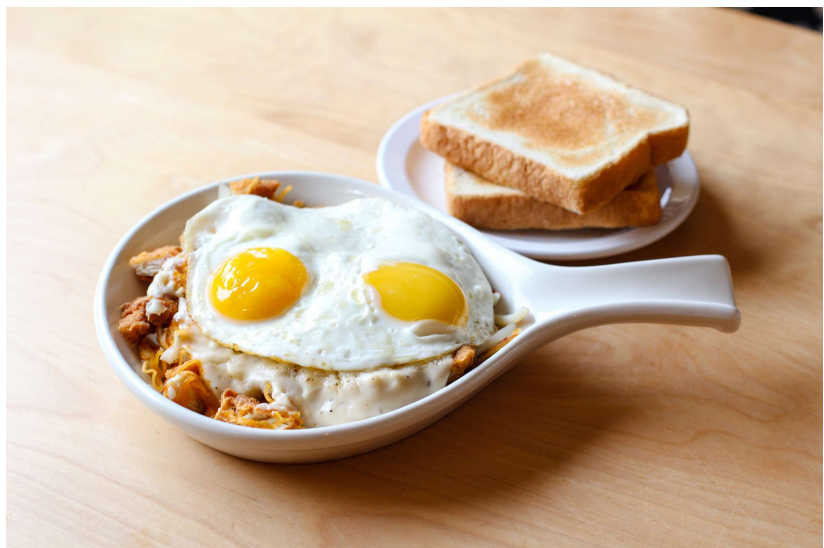
CHICKEN TENDER SKILLET