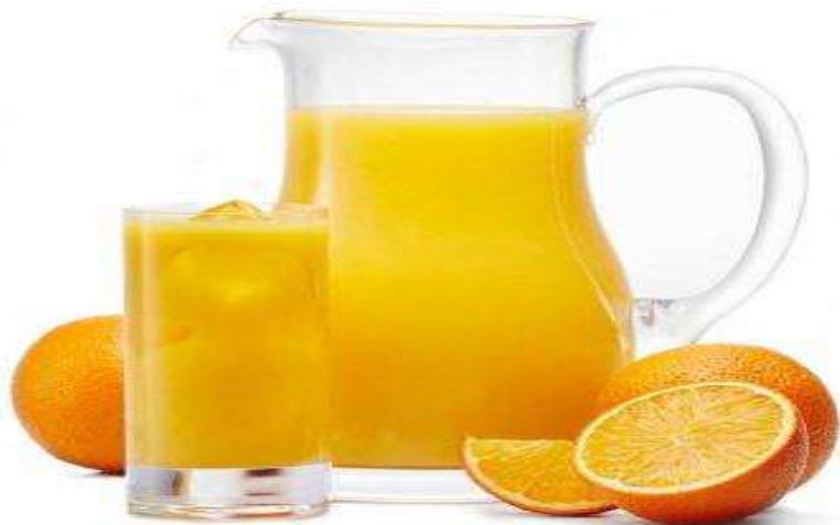
FRESH SQUEEZED ORANGE JUICE