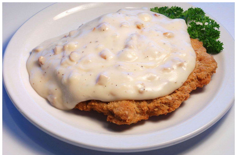
COUNTRY FRIED STEAK

* Wisconsin Food Safety Agencies advise that eating raw or under cooked meat, poultry, eggs or seafood poses health risk to everyone. For further information contact your physician or public health department.