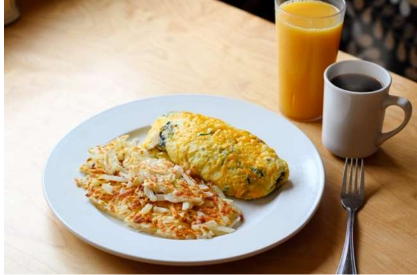
SPINACH MUSHROOM & CHEDDAR CHEESE OMELETTE