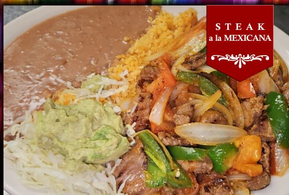
STEAK a la MEXICANA

Pan fried chicken breast topped with sautéed pico de gallo. Served with guacamole, rice, beans and homemade tortillas.