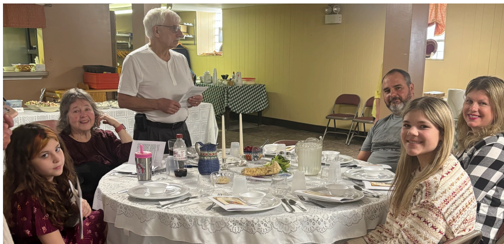
Seder Dinner Table 2