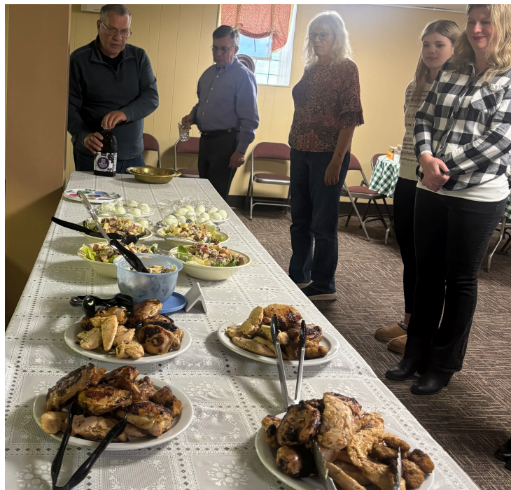
Waiting for dinner