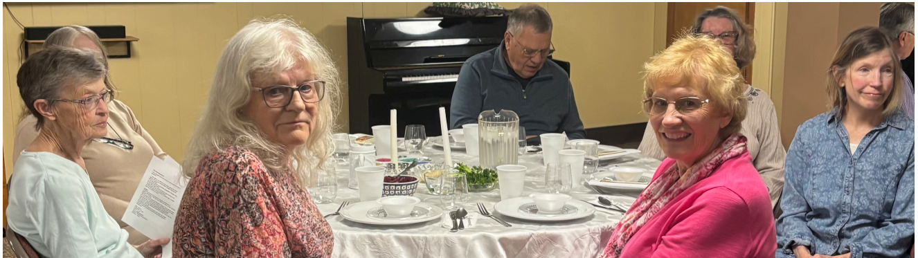
Seder Dinner Table 3

Another way to request prayer is to send an email to dreamstogo2@gmail.com with a prayer request, praise or update. This request is prayed for by the moderator then forwarded to the members of the email Prayer Team.. If you are so inclined to become part of the email prayer team, send a request to dreamstogo2@gmail.com and you will be included on the list. The deacons and elders have their own text prayer groups that share prayer requests as well. The intercessory prayer team meets on Tuesday mornings at 10AM. and prays for all the prayer requests that come to Round Hill in the past week including the requests of the Food Pantry Clients and other events. Should you be interested in joining the intercessory prayer team, come to the C.E. Building on Tuesday mornings at 10AM. when you can.