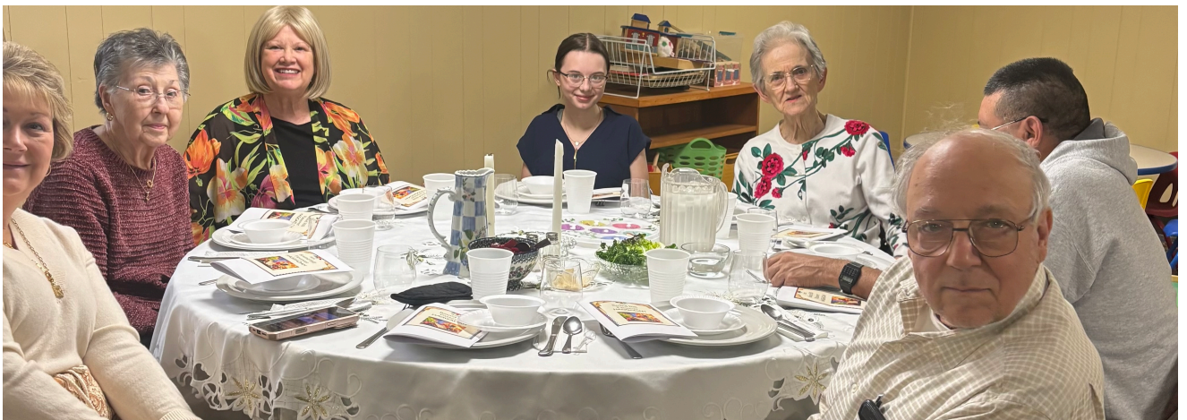
Seder Dinner Table 4