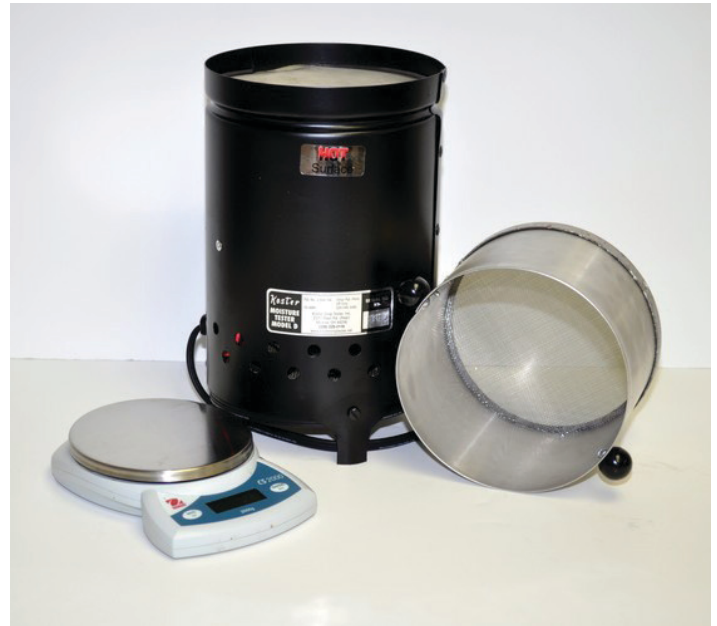
Figure 1. Koster moisture tester.

The main forced-air dryer for on-farm use is the Koster Tester (Figure 1). It is an electrical appliance equipped with a heater and a fan which blows hot air through a screen onto the sample. Drying time varies with sample size and material, but the process should take between 20 and 50 minutes. Food dehydrators are another option. Those operate with low temperature and low humidity and may take overnight to dry the sample. Similar to the Koster method, an “air fryer” can be used to dry the samples (Saverson 2019).