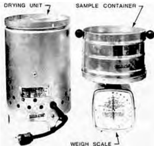
FIGURE 1. Koster Forage Moisture Tester.

$200.00 (June 1981, f.o.b. Cleveland, Ohio, U.S.A.)