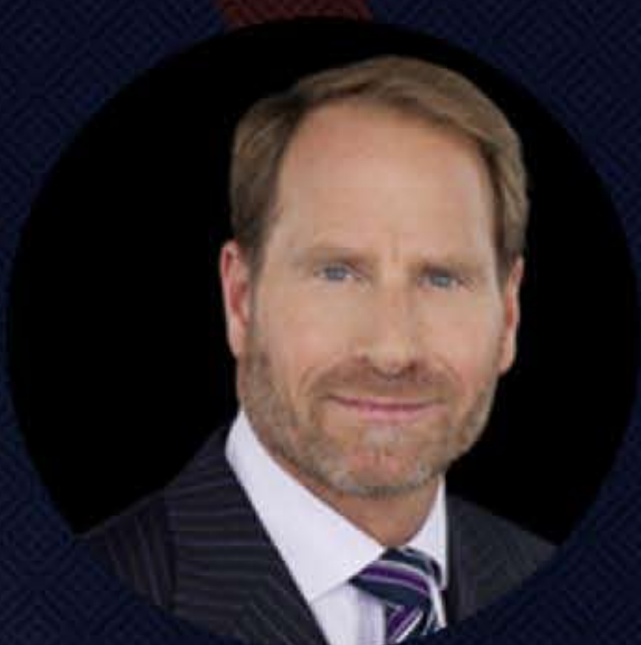
KENT SWIG SWIG EQUITIES