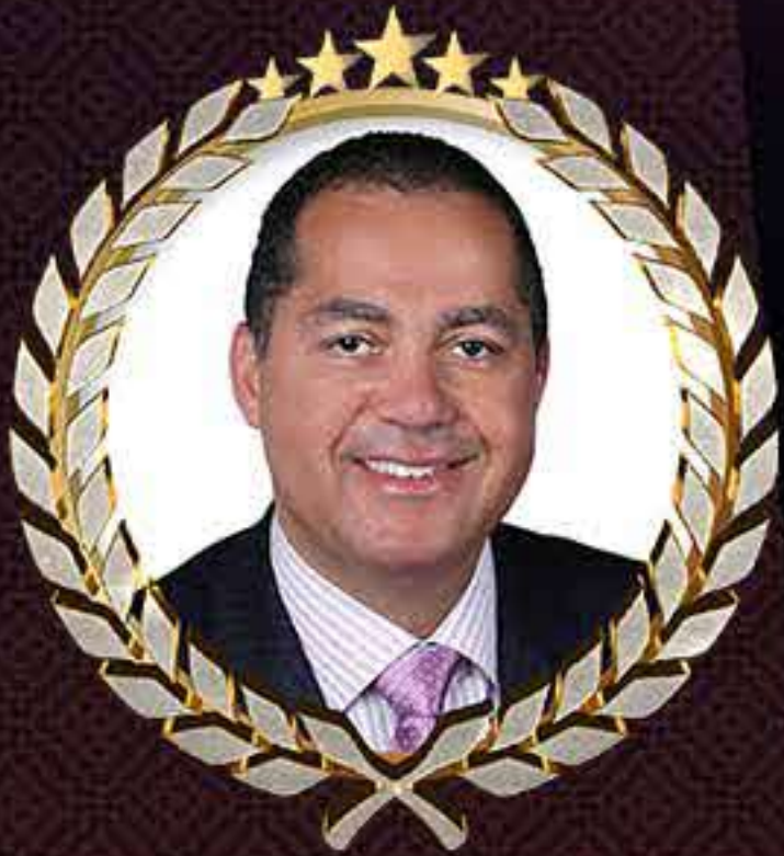
DON PEEBLES 2022

Lifetime Leadership in Real Estate The Peebles Corporation