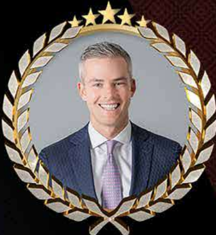
RYAN SERHANT 2022

Retail Leasing Broker of the Year Meridian Capital Group