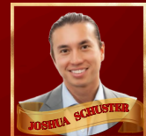
COMEBACK DEVELOPER OF THE YEAR SILVERBACK DEVELOPMENT