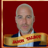
STUDENT HOUSING DEVELOPER OF THE YEAR WORKFORCE HOUSING PARTNERS LLC