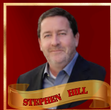
STEPHEN HILL HIGH-RISE ARCHITECTURE FIRM OF THE YEAR HILL I WEST