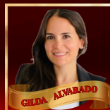
HOTEL BROKER OF THE YEAR JLL