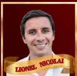
LIONEL NICOLAI LUXURY CONSTRUCTION PROJECT OF THE YEAR SABAL LUXURY BUILDER