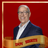
INDUSTRIAL DEVELOPER OF THE YEAR DHPH