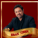
ERAN CHEN THE MOST INNOVATIVE ARCHITECT OF THE YEAR ODA