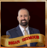
REAL ESTATE LAW FIRM OF THE YEAR GUNSTER