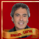
ISMAEL LEYVA ARCHITECTS