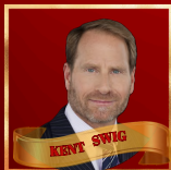
DISTINGUISHED NEW YORKER OF THE YEAR SWIG EQUITIES