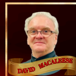
REAL ESTATE TECH PRODUCT OF THE YEAR SURGICALLY CLEAN AIR