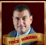
TECH PLATFORM OF THE YEAR PROPERTY SHARK