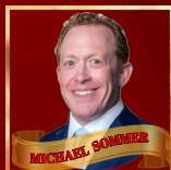
DEVELOPER OF THE YEAR KUSHNER COMPANIES