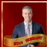
RYAN SERHANT PREMIER REAL ESTATE BROKER OF THE YEAR SERHANT