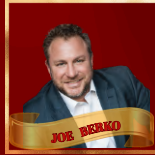
PRIVATE EQUITY FIRM OF THE YEAR ASTOR REALTY CAPITAL