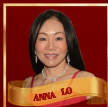
WOMAN IN REAL ESTATE ACQUISITIONS CAPITAL RISING LLC