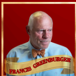
LIFETIME ACHIEVEMENT IN REAL ESTATE INVESTMENTS TIME EQUITIES