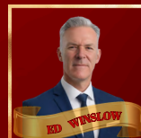
ED WINSLOW REAL ESTATE BOOK OF THE YEAR NICHEQUEST MEDIA