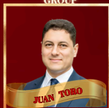
GEA CONSULTING ENGINEERS