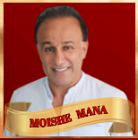
REAL ESTATE ENTREPRENEUR OF THE YEAR MANA COMMON