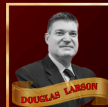
COMMERCIAL APPRAISER OF THE YEAR NEWMARK