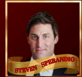
FINANCING BROKER OF THE YEAR RIPCO