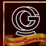
ONAL GALLANT BAYRAM & AMIN