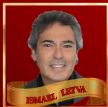
ISMAEL LEYVA LIFETIME ACHIEVEMENT IN ARCHITECTURE ISMAEL LEYVA ARCHITECTS