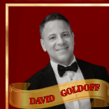
PROPERTY MANAGEMENT COMPANY OF THE YEAR CAMELOT REALTY GROUP