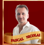
RESIDENTIAL LUXURY WATERFRONT DESIGN-BUILT DEVELOPER OF THE YEAR SABAL LUXURY BUILDERS