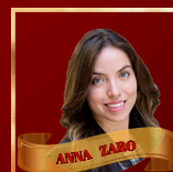
THE MOST INFLUENTIAL WOMAN IN REAL ESTATE ANNAZARRO