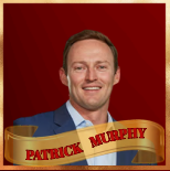
THE MOST INNOVATIVE CONTRACTOR OF THE YEAR COASTAL CONSTRUCTION