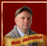
NON PROFIT ORGANIZATION OF THE YEAR THE FLOATING HOSPITAL