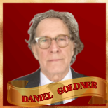
MIXED USE ARCHITECTURAL AND INTERIORS FIRM OF THE YEAR DANIEL GOLDNER ARCHITECTS