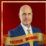
LIFETIME ACHIEVEMENT IN REAL ESTATE INVESTMENTS MUSSO PROPERTIES, LLC