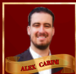
INTERNATIONAL BROKER OF THE YEAR CARINI GROUP