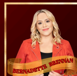
USER SALE OF THE YEAR SERHANT