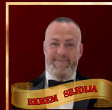
DIANA ART CONSTRUCTION METRO AREA RESIDENTIAL CONTRACTOR OF THE YEAR DIANA ART CONSTRUCTION

2024 ARCHITECTURE & CONSTRUCTION RED AWARDS PHOTOS