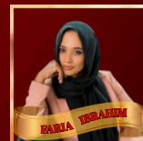
EMERGING DEVELOPER OF THE YEAR HUDSON EDGE REAL ESTATE