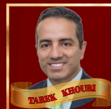
ENVIRONMENTAL ENGINEER OF THE YEAR HYDROTECH ENVIRONMENTAL