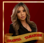
THE MOST INFLUENTIAL BROKER IN NEW YORK APT112