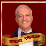
RENTAL LUXURY DEVELOPER OF THE YEAR TORKIAN GROUP