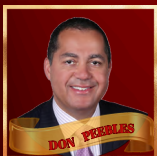
DON PEEBLES LIFETIME ACHIEVEMENT IN REAL ESTATE THE PEEBLES CORPORATION