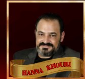
EMERGING ENGINEERING FIRM OF THE YEAR DYNAMIC EARTH