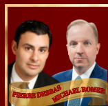
ROMER DEBBAS, LLP REAL ESTATE LAW FIRM OF THE YEAR ROMER DEBBAS, LLP