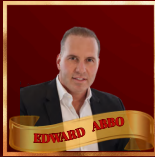
MULTIFAMILY DEVELOPER OF THE YEAR THE APOLLO COMPANIES