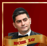
YOUNG DEVELOPER OF THE YEAR DIAMOND DEVELOPMENT GROUP