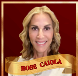
BETTINA EQUITIES PROPERTY MANAGER OF THE YEAR BETTINA EQUITIES