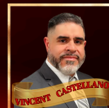
MECHANICAL CONTRACTOR OF THE YEAR VS PRIME MECHANICAL