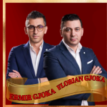
BUILDING TRANSFORMATION & ADAPTIVE REUSE PROJECT OF THE YEAR QUINCY THREESTUDIO