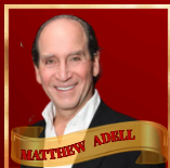
LIFETIME ACHIEVEMENT IN REAL ESTATE DEVELOPMENT ADELLO