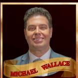
TAX SAVER OF THE YEAR WALLACE INVESTMENTS