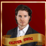
YOUNG EXECUTIVE OF THE YEAR SOJA VENTURES, LLC HELMSELEY SPEAR