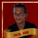
JACK AINI BEST BOUTIQUE HOTEL OF THE YEAR REFINERY HOTEL