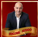
BEST RESIDENTIAL DEVELOPER/BROOKLYN AVDOO & PARTNERS DEVELOPMENT