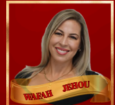
WOMAN ENTREPRENEUR OF THE YEAR ATLAS SHOWROOM