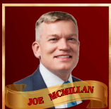
DESIGN & BUILT DEVELOPER OF THE YEAR DDG