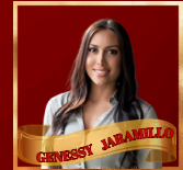
COMMERCIAL BROKERAGE - RISING STAR CROSSMARC SERVICES