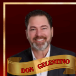
ELEVATOR CONTRACTOR OF THE YEAR CHAMPION ELEVATOR