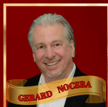
ASSET MANAGEMENT FIRM OF THE YEAR RESOLUTION REAL ESTATE