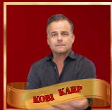
KOBI KARP ARCHITECTURE