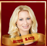
TIDES TURN CAPITAL