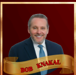
DEVELOPMENT SITE SALES BROKER OF THE YEAR JLL