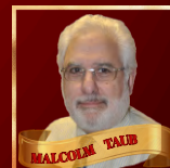
ATTORNEY OF THE YEAR TAUB & LEWIS LLP