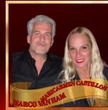
INTERIOR DESIGN FIRM OF THE YEAR CASTILLON VAN HAM