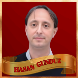
LOAN OFFICER OF THE YEAR ANNIE MAC HOME MORTGAGE