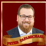
UP AND COMING DEVELOPER OF THE YEAR VOREA GROUP