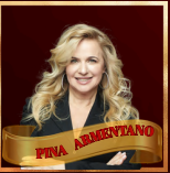
REAL ESTATE INFLUENCER OF THE YEAR LA DAMA DEL REAL ESTATE