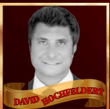
ACQUISITIONS OFFICER OF THE YEAR NAFTALI GROUP