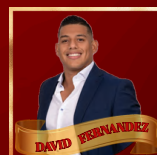
THE NEW DEVELOPMENT BROKER OF THE YEAR SERHANT