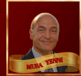
MEP ENGINEERING FIRM OF THE YEAR FELLER ENGINEERING