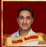
HOTEL & RESORT DEVELOPMENT OF THE YEAR EVEREST PLACE DEVELOPMENT