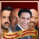
OKO GROUP-SLCE ARCHITECTS UNITY CONSTRUCTION GROUP MG ENGINEERING LUXURY DEVELOPMENT PROJECT OF THE YEAR THE CROWN BUILDING