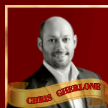
OFFICE BUILDING DEVELOPMENT OF THE YEAR 125 WEST 57TH STREET ALCHEMY-ABR INVESTMENT PARTNERS