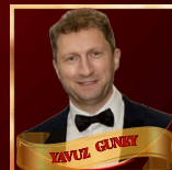
CONTRACTOR OF THE YEAR PERA CONSTRUCTION