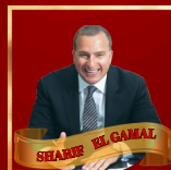
FASTEST GROWING DEVELOPER OF THE YEAR SOHO PROPERTIES