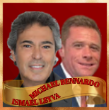
ISMAEL LEVYA ARCHITECTS KEYSTONE BUILDERS CONDO CONVERSION PROJECT OF THE YEAR, TRIBECA GREEN, NYC