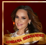
THE MOST INFLUENTIAL BROKER IN FLORIDA AQUALINA REALTY INC.