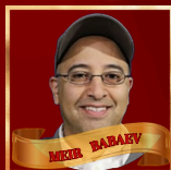
EMERGING DEVELOPER OF THE YEAR AB CAPSTONE