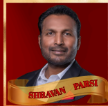
TOP MULTIFAMILY INVESTOR OF THE YEAR AMERICAN VENTURES