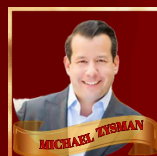
MORTGAGE BROKER OF THE YEAR CITY BAY CAPITAL