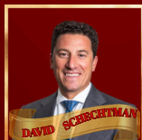
INVESTMENT SALES BROKER OF THE YEAR MERIDIAN CAPITAL