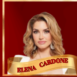
ENTREPRENEUR OF THE YEAR GRANT CARDONE ENTERPRISES