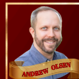
STUDENT HOUSING DEVELOPER OF THE YEAR HAWKINS WAY CAPITAL