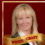
REAL ESTATE FAMILY OFFICE OF THE YEAR FULCRUM EQUITIES