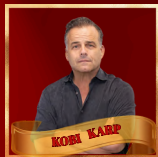
KOBI KARP ARCHITECT OF THE YEAR KOBI KARP ARCHITECTURE