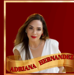
NEW DEVELOPMENT BROKER OF THE YEAR AQUALINA REALTY