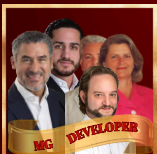
MC DEVELOPER LUXURY RESIDENTIAL PROJECT OF THE YEAR THE VILLAGE AT CORAL GABLES