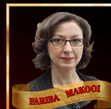
FISCHER + MAKOOI ARCHITECTURE