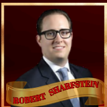
1031 EXCHANGE BROKER OF THE YEAR RPS MANAGEMENT