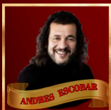
ARCHITECT OF THE YEAR LEMAI + ESCOBAR ARCHITECTURE