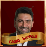
INTERNATIONAL INVESTOR OF THE YEAR WATERMARK INVESTMENTS