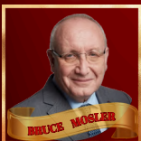
LIFETIME ACHIEVEMENT IN BROKERAGE CUSHMAN & WAKEFIELD