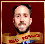
NEW YORK METRO RISING STAR ATTORNEY OF THE YEAR REYNGACH LAW, P.C.