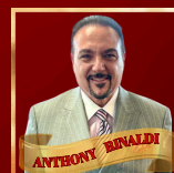
LUXURY CONSTRUCTION PROJECT OF THE YEAR THE MANDARIN ORIENTAL RESIDENCES RINALDI GROUP