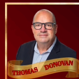
MERIDIAN CAPITAL GROUP