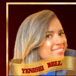
NAWIC PRESIDENT GNY CHAPTER #240