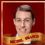
REIT EXECUTIVE OF THE YEAR VORNADO REALTY TRUST