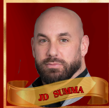
DEVELOPER + CONTRACTOR OF THE YEAR KINGS CAPITAL GROUP

2023 ARCHITECTURE AND CONSTRUCTION RED AWARDS PHOTOS