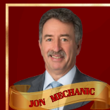
LIFETIME LEADERSHIP IN LAW PRACTICE FRIED FRANK