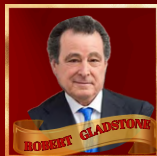
LUXURY DEVELOPER OF THE YEAR MADISON EQUITIES