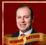
MORTGAGE BROKER OF THE YEAR MERIDIAN CAPITAL