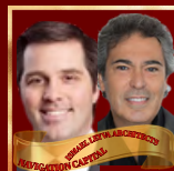
ISMAEL LEYVA ARCHITECTS HIGH RISE PROJECT OF THE YEAR 135 E 47TH STREET