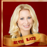
THE MOST INFLUENTIAL WOMAN IN REAL ESTATE TIDES TURN CAPITAL