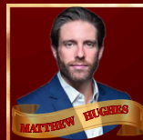
PREMIER BROKER OF THE YEAR BROWN HARRIS STEVENS