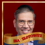
THE MOST INNOVATIVE MORTGAGE BROKER OF THE YEAR GPARENZY