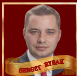
DEVELOPER OF THE YEAR RYBAK DEVELOPMENT