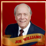
LIFETIME ACHIEVEMENT IN BROKERAGE KELLER WILLIAMS