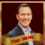
RETAIL LEASING BROKER OF THE YEAR ZELNIK & COMPANY LLC