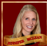
CFO OF THE YEAR KUSHNER COMPANIES