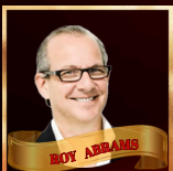
EMERGING TECH PLATFORM OF THE YEAR CRESCENDOM