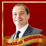
MULTIFAMILY INVESTOR OF THE YEAR A&E REAL ESTATE