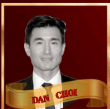
FASTEST GROWING DEVELOPER/ ARCHITECT OF THE YEAR LOGOS DEVELOPMENT