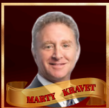
TITLE PROFESSIONAL OF THE YEAR ROYAL ABSTRACT