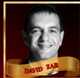
ZAR PROPERTY NY