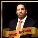
AURORA CAPITAL ASSOCIATES