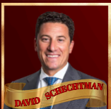
LOAN SALES BROKER OF THE YEAR MERIDIAN CAPITAL