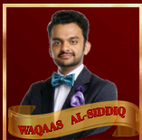
EMERGING MED TECH COMPANY OF THE YEAR BIOTRICITY