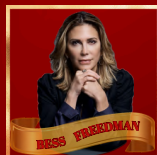
LIFETIME ACHIEVEMENT AWARD BROWN HARRIS STEVENS