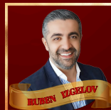
EMERGING PRIVATE LENDER OF THE YEAR WE LEND