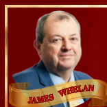
TRADE ORGANIZATION OF THE YEAR REBNY