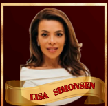
LUXURY BROKER OF THE YEAR DOUGLAS ELLIMAN