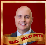
RESIDENTIAL MANAGEMENT FIRM OF THE YEAR ARGO REAL ESTATE LLC