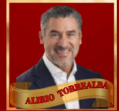
EMERGING DEVELOPER OF THE YEAR MG DEVELOPER