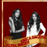
FASTEST GROWING FEMALE FOUNDED BROKERAGE DEVELOPMENT MARKETING TEAM