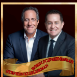
NEW DEVELOPMENT CONSULTANT OF THE YEAR BROWN HARRIS STEVENS DEVELOPMENT MARKETING