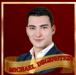
YOUNG REAL ESTATE PROFESSIONAL OF THE YEAR KW COMMERCIAL