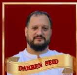
DAREN SED EPIMONI RENTAL PROJECT OF THE YEAR OLIVE & WOOSTER, NEW HAVEN, CT