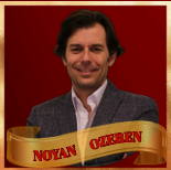
FACADE CONTRACTOR OF THE YEAR FACADE 41