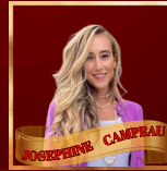
UP AND COMING DEVELOPER OF THE YEAR CAMACO DEVELOPMENT