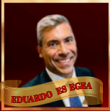
HOLISTIC ARCHITECTURE FIRM OF THE YEAR LEO A DALY