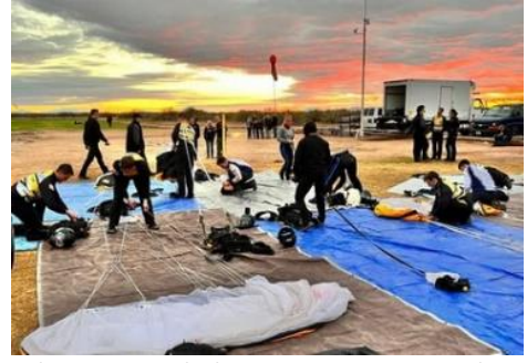
A luminescent sky hovers over USNAPT packers.

This article is intended to punctuate two coincidental occurrences. One, the celebration of the wonderful response from the USNAPT family of supporters; two, the celebration of the efficacy of that response; to wit, the TEAM's commendable fulfillment as the representatives of the USNA, and the U.S. Navy & Marine Corps, not only in athletic performance, but as the face of the services.