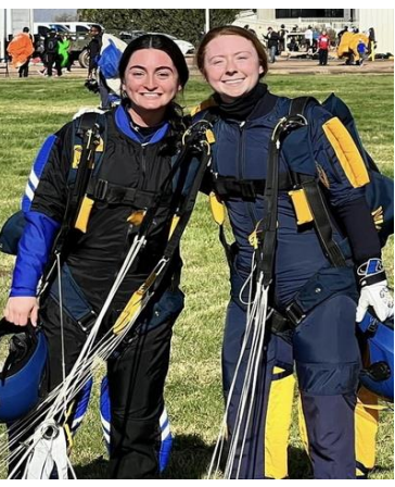
Tulips' smiles reflect desert sun