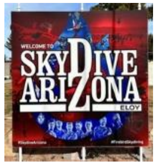
Eloy entrance sign