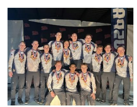
The USNAPT medal winners.