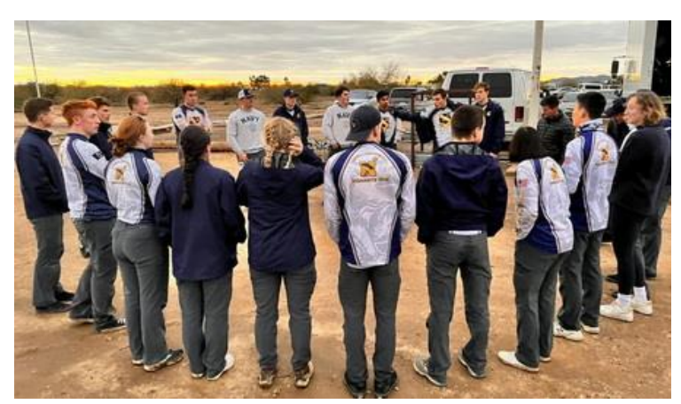
TEAM morning briefing