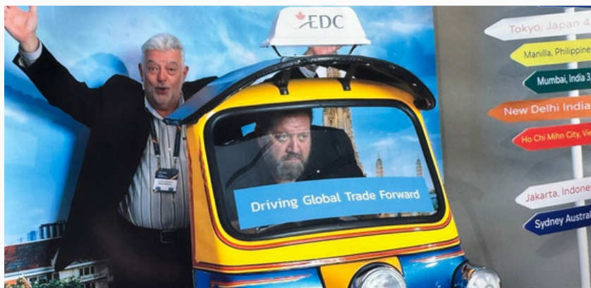
2025: They attended a trade mission together in Bangkok