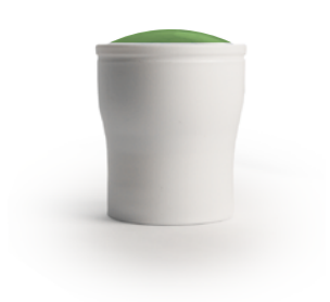
ALL PURPOSE CLEANER