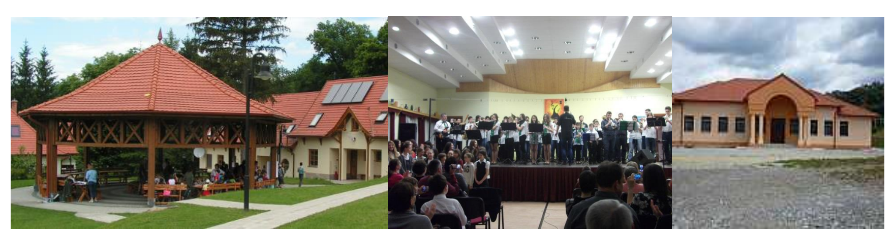
Europe > Hungary > Felsotarkany

There are about 3500 inhabitants in Felsőtárkány. We have got several institutions for public education and cultural programmes. It includes the primary school, the kindergarten, the school of music, local library and the cultural centre.