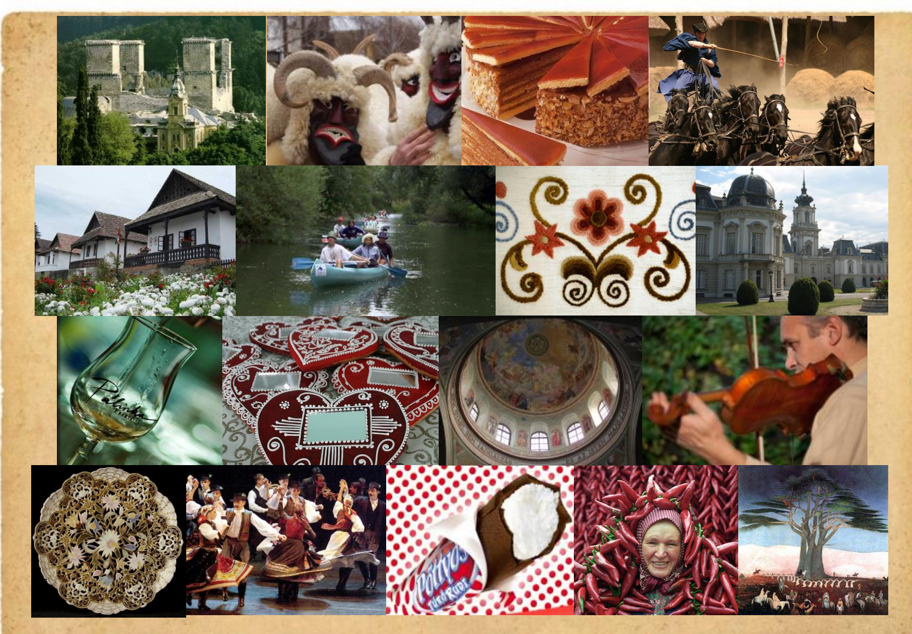
Hungary-living traditions, colorful history & culture