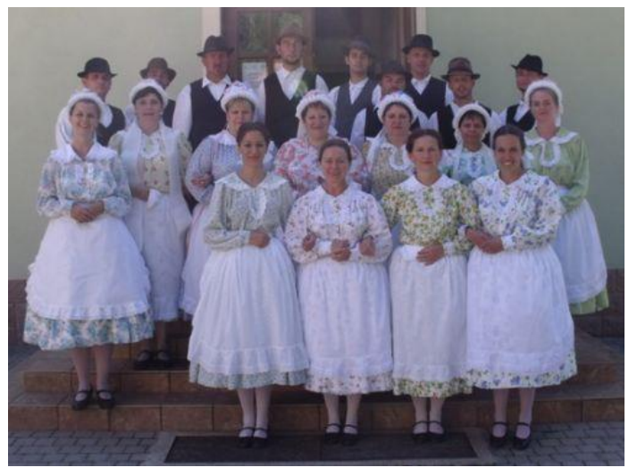
Felsőtárkány preserves its unique folk traditions

We have got our own children's rhymes, songs, folkdance and costume.