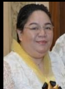
LYN CUENZA Deputy Sec. Gen. for Mindanao