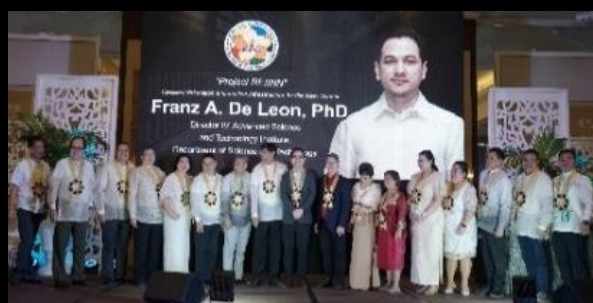
IN Photos: 25 th Anniversary FAPSA NATIONAL. Feb. 2,2023 @Manila Hotel

The Federation Of Associations Of Private School Administrators is an EDUCATIONAL COMMUNITY ORGANIZATION comprising of Administrators, Teachers, Non-Teaching Personnel, Parents and Students of Private Schools, Colleges, and Universities bound together by similar interest, welfare, and concerns.