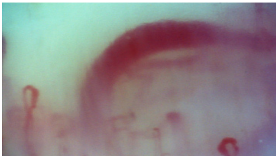
Late Scleroderma Pattern