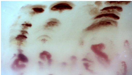
Active Scleroderma Pattern