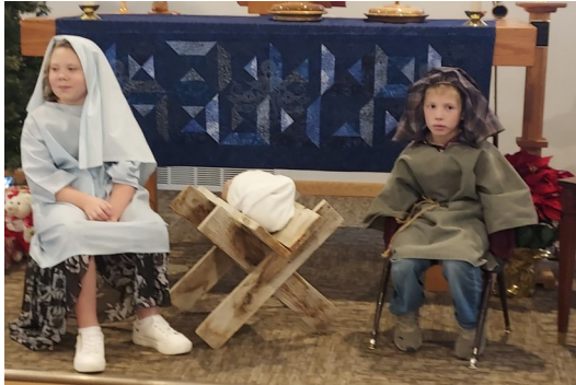
The Sunday School presented: