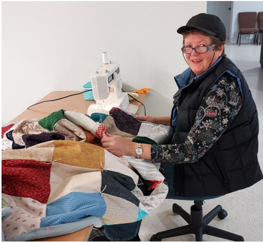
Wednesday Workers! Come join us!