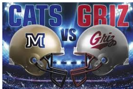
Our church donated a total of $480 for the Campus Ministry at both Universities. Grizzly Fans donated $190 and Bobcat Fans donated $290.