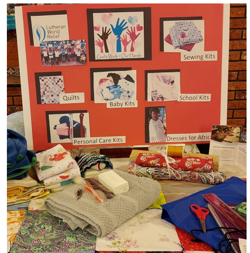
The mission kits are a gift of love and hope worldwide for all those in need.