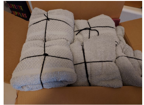
We had three deliveries to God's Love. You shared personal care kits, clothing, medical equipment and food. Thank you!