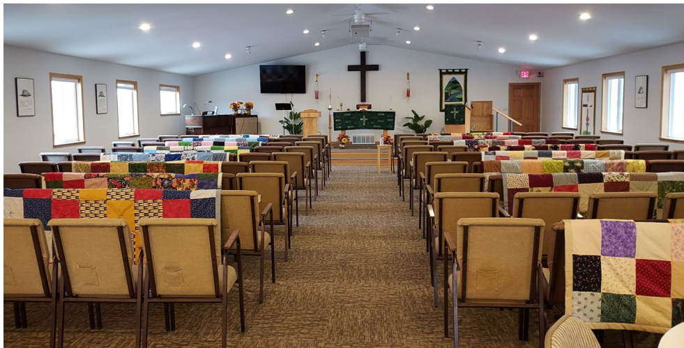
The quilters displayed their quilts for Lutheran World Relief at the Thankoffering Service.