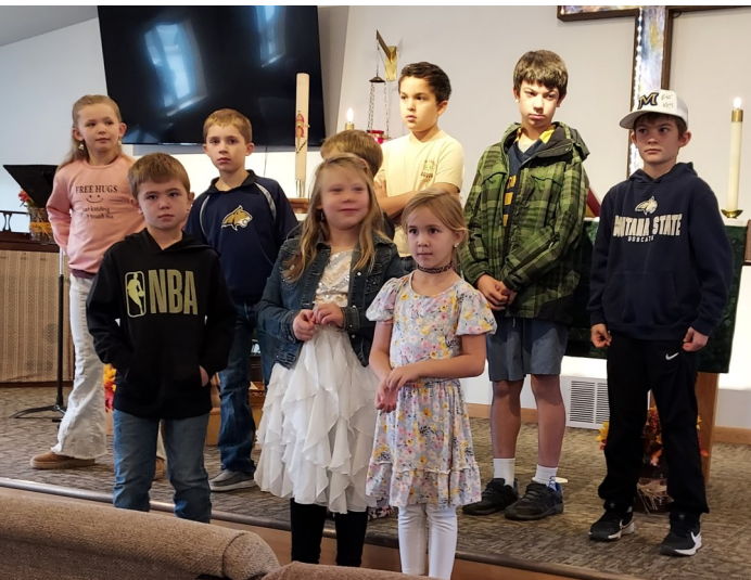
Special Music from our Sunday School Children