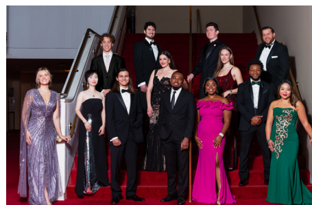
The 2025–2026 Cafritz Young Artists

For more on the Cafritz Young Artists, visit the WNO website at washnatopera.org/cafritz-young-artists .