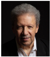
Anthony Davis COMPOSER MENTOR

WNO History: AOI (Composer Mentor), 2020–2021