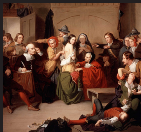
Detail from The Examination of a Witch by T.H. Matterson

Since 2017, the Salem Witch Hunt Museum in Massachusetts has asked visitors to consider patterns of behavior that have sparked witch hunts, from 1692 to the present, using this formula: