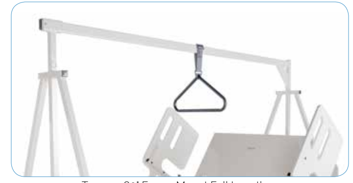
Trapeze 80" Frame Mount Full Length, Deluxe Plastic Rails (set-LH/RH)