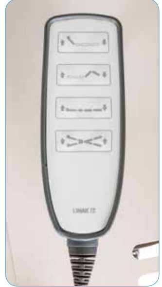
Trend/Rev Trend Hand Control (5-function)

GL94000.....8" Bolster Mattress and Ext. Pan Kit