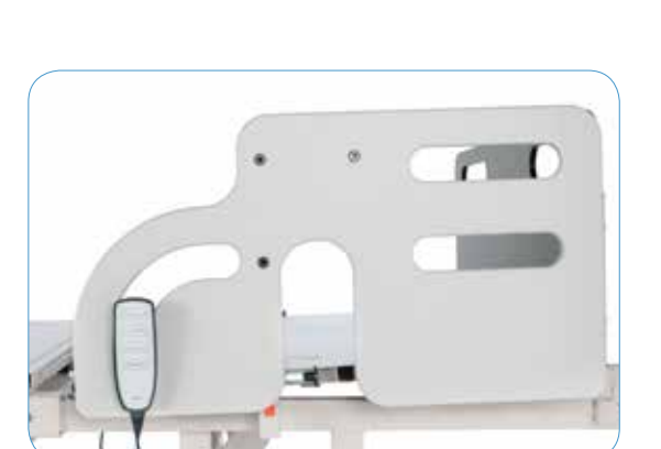
Deluxe Plastic Rails (set-LH/RH), shown with optional 5-function Hand Control