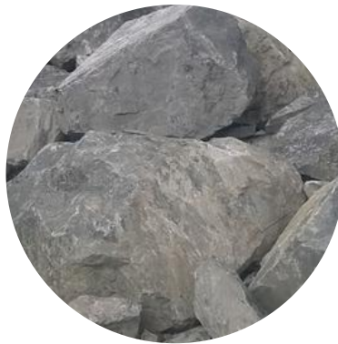
Armor Rock 1-3 ton