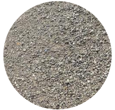
Base Coarse 200mm