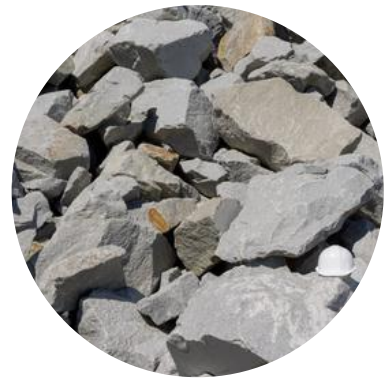
Underlayer Rock 500-1000Kg