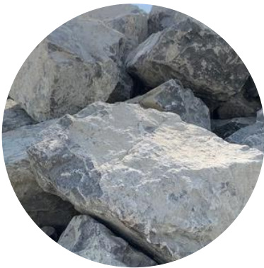
Quarry Run 100-150kg