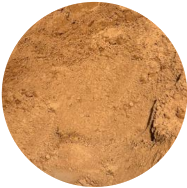
Red Dune Sand