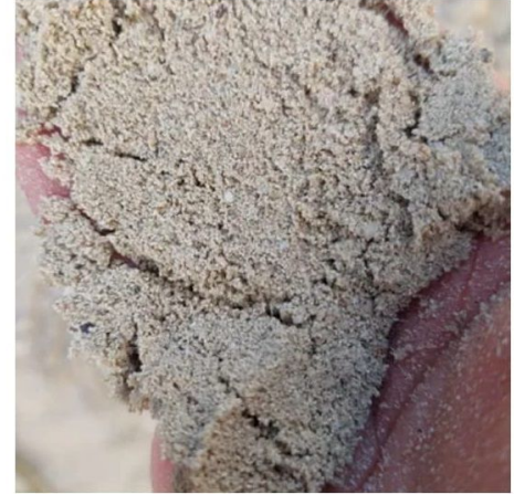
Multi Washed Sand