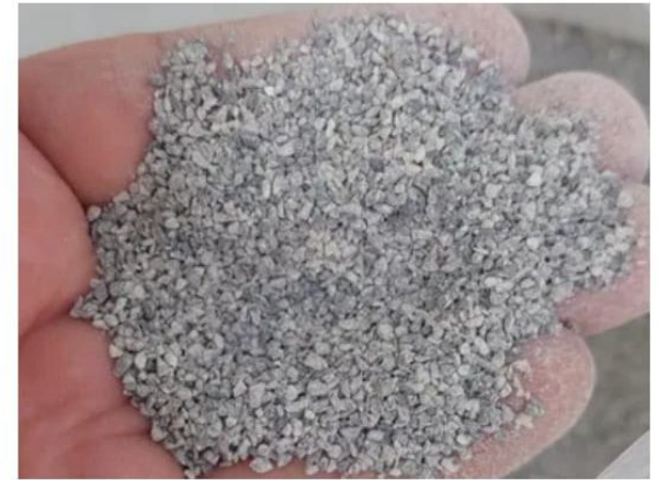
Fine Aggregates 0.6-1.18mm