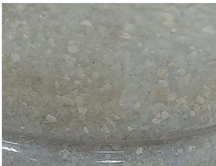
Aquarium Sand Washed