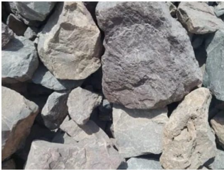
Boulder 4-6 inch Multi Colors