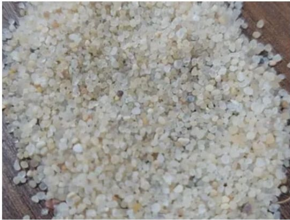
Silica Sand 1mm

Fine and coarse aggregates, sifted and separated upon request