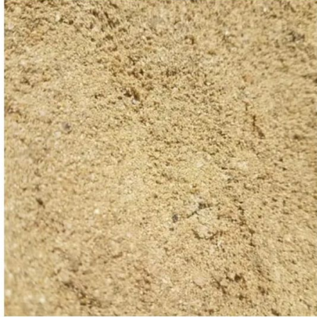
Plaster Sand Washed