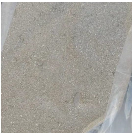
Beach Sand White Soft