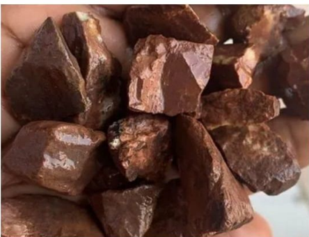
Washed Brown Gravel