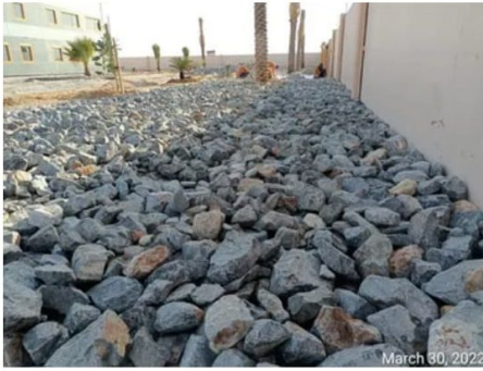
4-6 inch Boulder Grey

Landscape rocks and gravels ,segregated as required