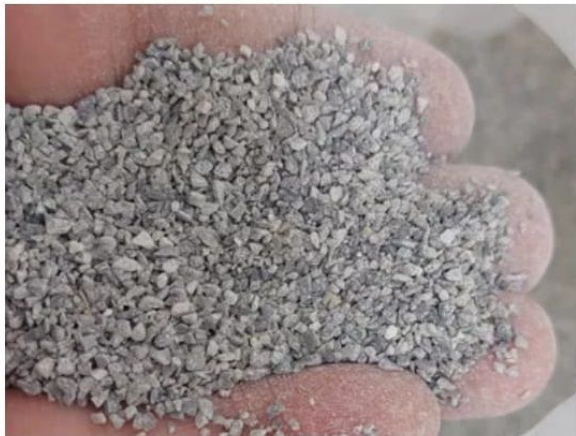
Fine Aggregate 0.6-1.67mm