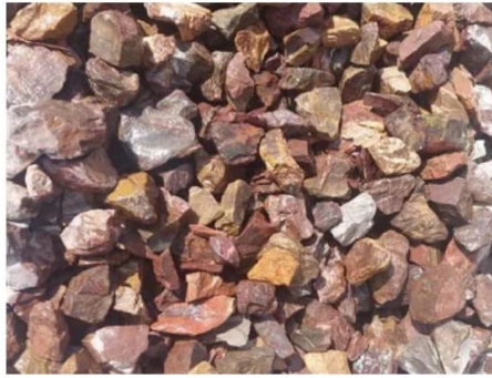
Multi Color Gravel