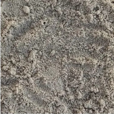
Sea Sand Washed