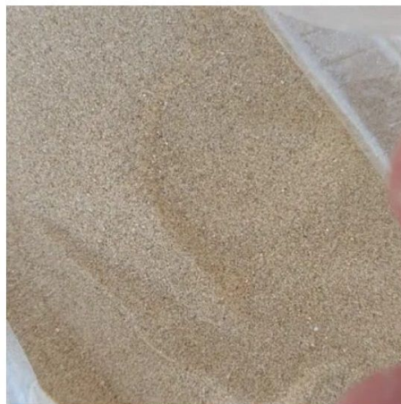
Beach Sand Yellow