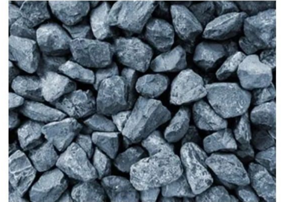
5-10mm Washed Gabbro