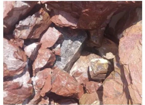
Boulder 4-6 inch Brown