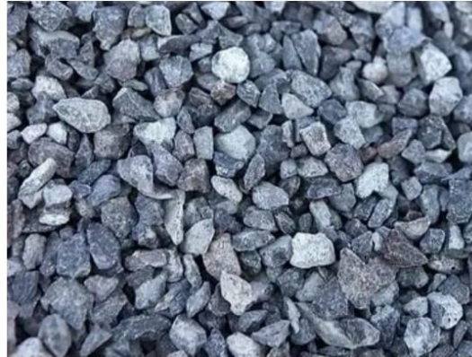
5-10mm Washed Gabbro