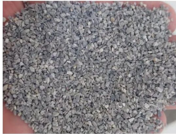
Fine Aggregates 1.67-2.67mm