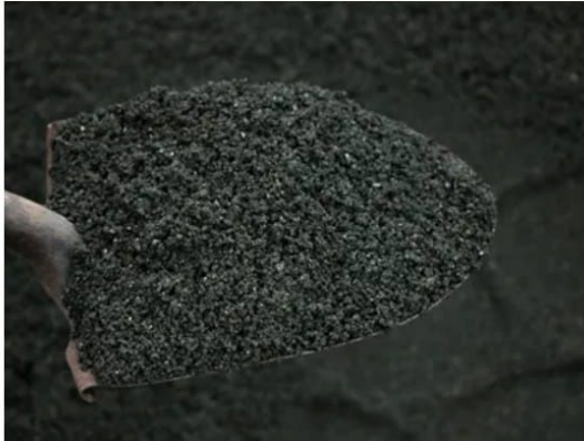
0-3mm Washed Sand

Improved material by rescreening and washing, free from dust and clays