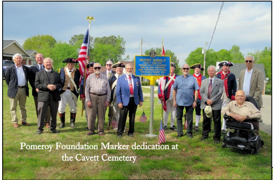
Pomeroy Foundation Marker dedication at the Cavett Cemetery