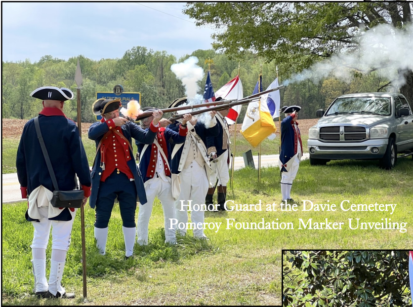
Honor Guard at the Davie Cemetery Pomeroy Foundation Marker Unveiling