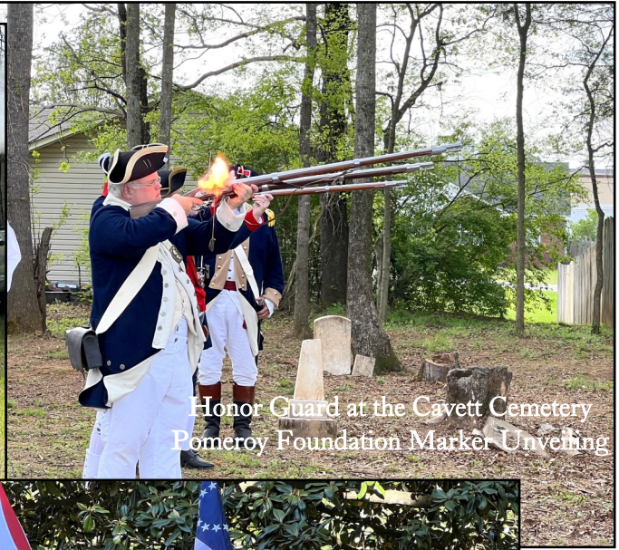
Honor Guard at the Cavett Cemetery Pomeroy Foundation Marker Unveiling