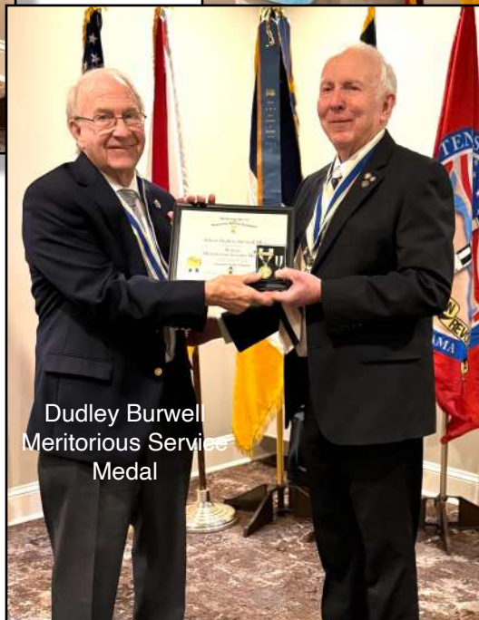
Dudley Burwell Meritorious Service Medal