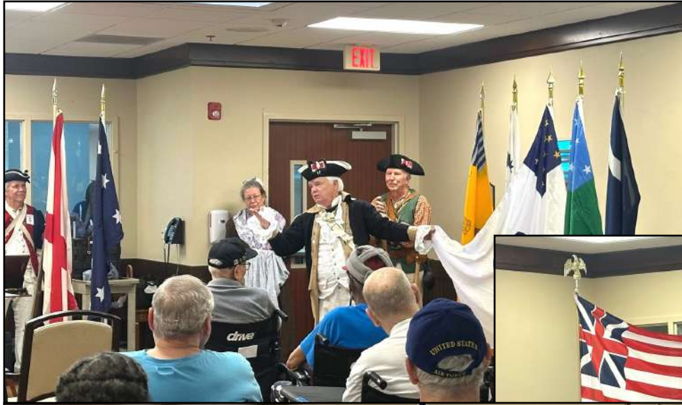
The Color Guard gave a program at Tut Fann Veterans Home on April 16th.