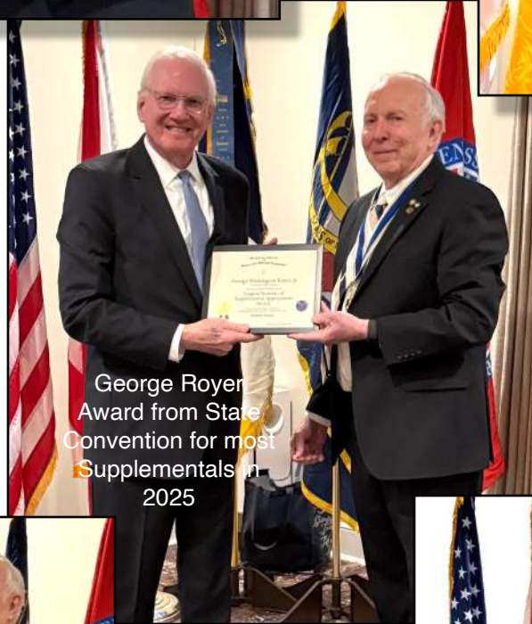
George Royer Award from State Convention for most Supplementals in 2025