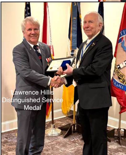
Lawrence Hillis Distinguished Service Medal