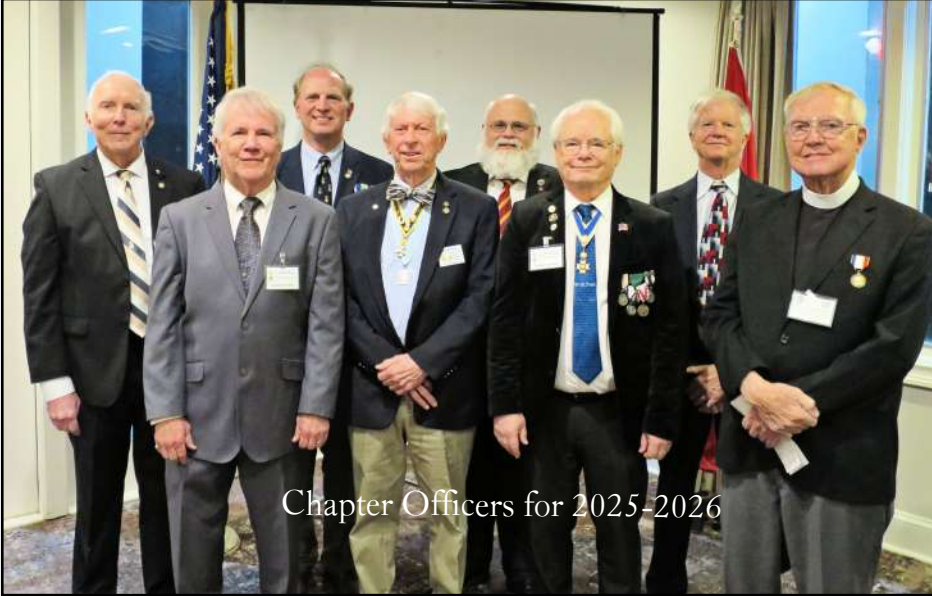
Chapter Officers for 2025-2026