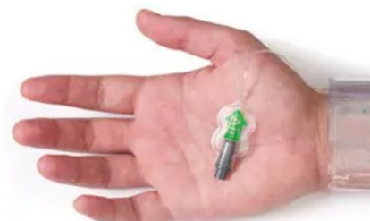
Typical radial artery compression band after procedure