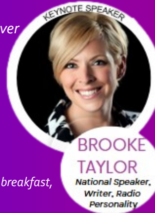
BROOKE TAYLOR National Speaker, Writer, Radio Personality

includes continental breakfast, lunch, and materials