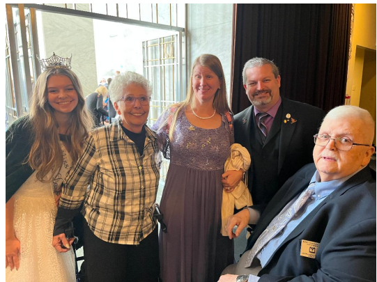
Jerry Chandler Memorial: 2pm 8/5 Eternal Valley