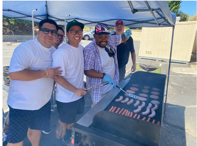
4th of July at Old West!

August 24 OES Yard Sale at the Hill home 7:00am -12 noon. (See attached flyer)