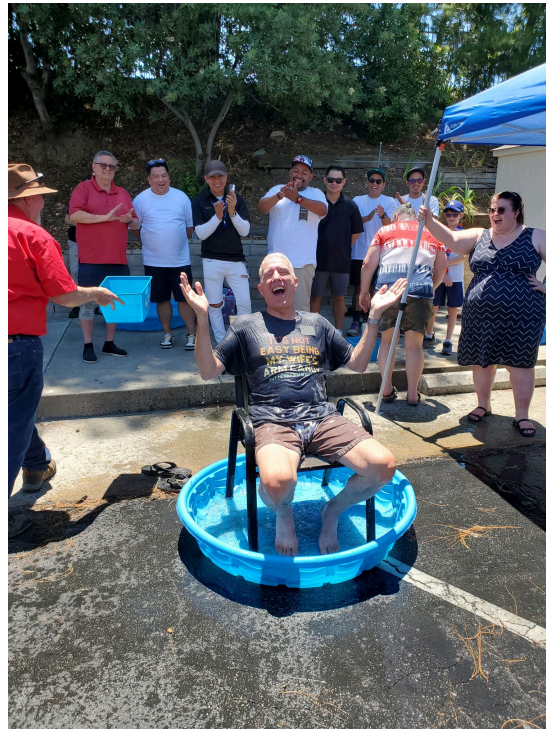
Job's "Dunk Tank" with the Grand Master!