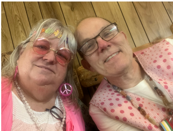
Some Hippies at our 3/14 OES Mtg.