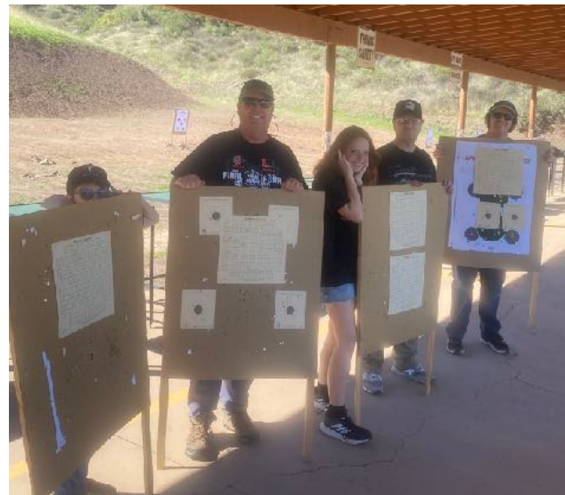
Pistol Marksmanship with OW DeMolay