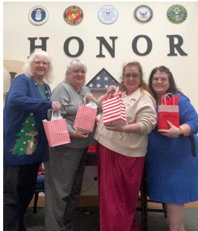
L'Bri gifts to the SRC