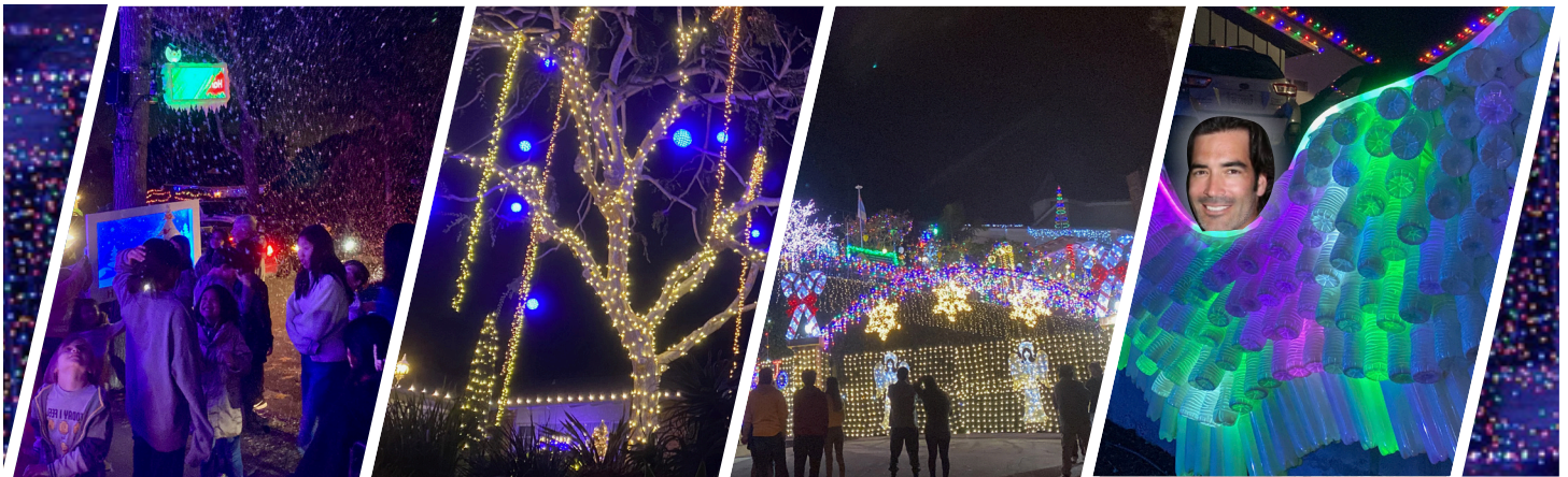
(headshot of Carter Oosterhouse)

We had a fantastic holiday season last year as we celebrated 70 years of Light Up festivities in the Ranch! The anticipatory buzz could be felt throughout our community as neighbors and households either participated for the first time or refreshed their decorations, allowing visitors (many of them returning) to kick off the holidays with a new level of excitement. There was hot chocolate, "real" snow, celebrity sightings (Carter Oosterhouse, anybody?), spontaneous caroling, hollers of "Merry Christmas!" from children (and their parents!), Santa sightings, shared awe over a miniature Christmas village (complete with a working railroad track and monorail!), and more! And of course, who can forget the spectacular light show, life-sized color-changing angel wings, and large crowds surrounding the Harbeck residence...winners of The Great Christmas Light Fight?! As we look forward to another season of lights, we hope you will find renewed inspiration from the sentiments of a few of our younger visitors!