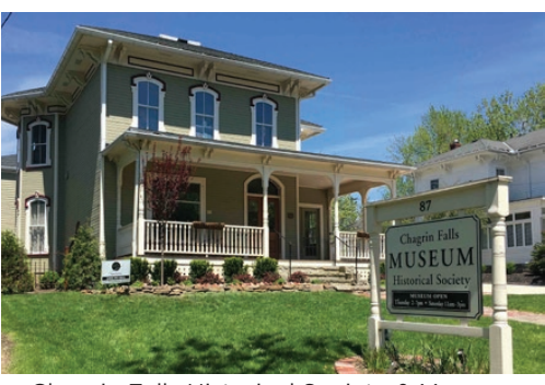
Chagrin Falls Historical Society & Museum

Learn more about the Bainbridge Township Historical Society by visiting https://bainbridgehistoricalsociety.org/.