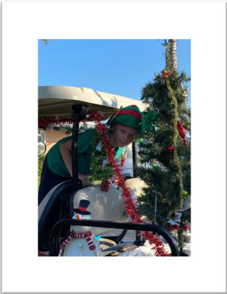
G O L F C A R T P A R A D E