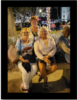
St, Augustine Bus Trip