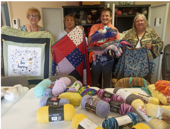
Recently Nimble Fingers donated 17 blankets, 7 animals and 3 bed jackets to our local hospice.