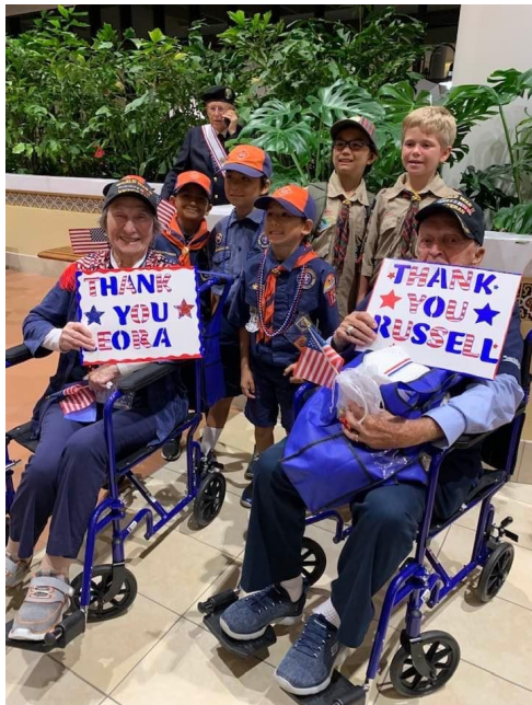
Some of the Welcome Committee