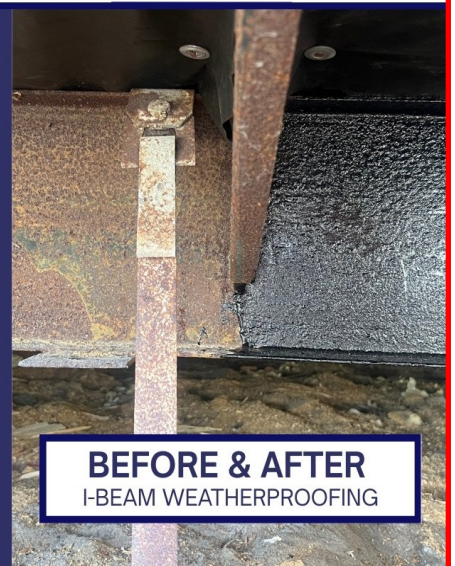
BEFORE & AFTER I-BEAM WEATHERPROOFING

Freedom Vapor Barrier – It's in the Name. Superior Quality. Made in the USA.