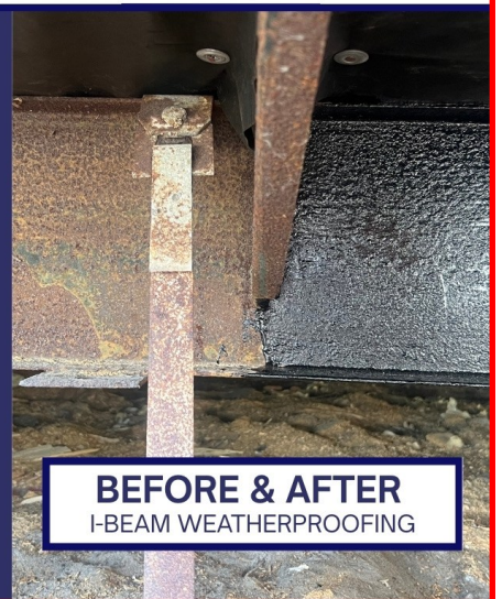
BEFORE & AFTER I-BEAM WEATHERPROOFING

Freedom Vapor Barrier — It's in the Name. Superior Quality. Made in the USA.