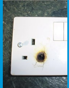
Typical examples of potentially dangerous electrical installations