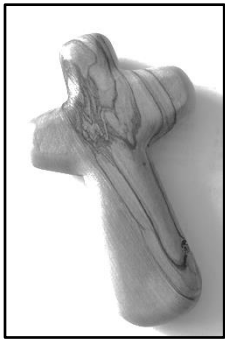
3" x 5"

When the cross was finished, the mountain was re-named Mt. Krizevac, or "Cross Mountain" and became a Hallmark of Medjugorje long before the village even appeared on a map, or the Apparitions began. Looking back, it appears that the erection of that cross was a foreshadowing of great things to come.