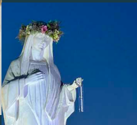
Our Lady of Medjugorje

In the wake of Vatican II, the Catholic Charismatic Renewal began to gather strength across the United States. By the 1970s, Florida had become a hotbed of this movement, with numerous conferences, prayer groups, and healing ministries emerging.