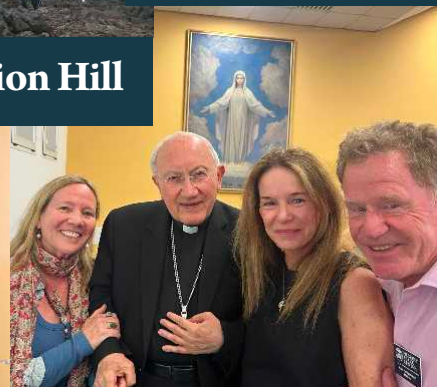
Archbishop Aldo Cavalli