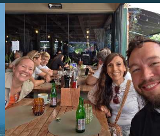
Local Lunch Time!