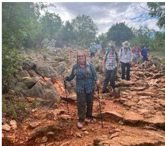
Climbing Apparition Hill

JOIN US on our next trip in JUNE, 2026! For more trip details and for a downloadable registration form, go to pilgrimspeacecenter.org