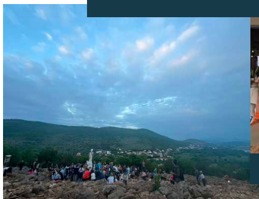
Praying on Apparition Hill