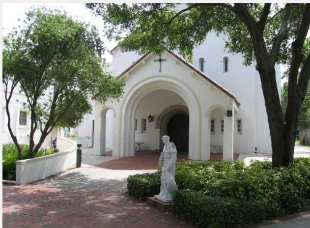
St. Cecilia, Clearwater, FL