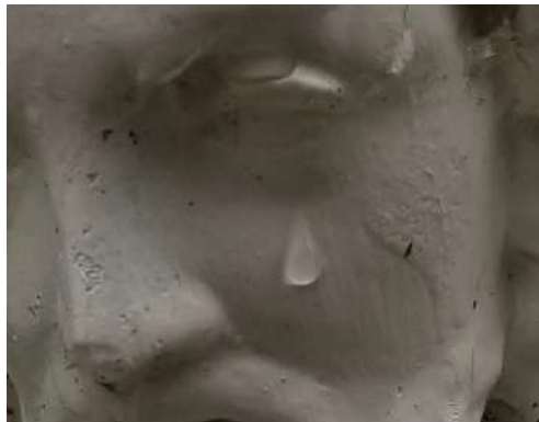
“Crying Jesus” (Statue at the Shrine on August 18, 2022, 11 days before Ida hit shrine area on August 29, 2021.)