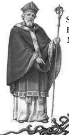
St. Patrick Feast Day March 17

Sunday, March 22 at 3PM in St Joseph Church in New Orleans. This event is for couples married in the year 1995, in celebration of their 25th Wedding Anniversary. This will be a prayer service. Please register by Monday, February 3rd, by contacting your church office.