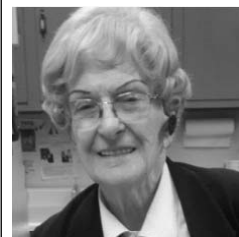
Gertrude Gayle Ponseti Oct 14, 1937-Dec 10, 2019