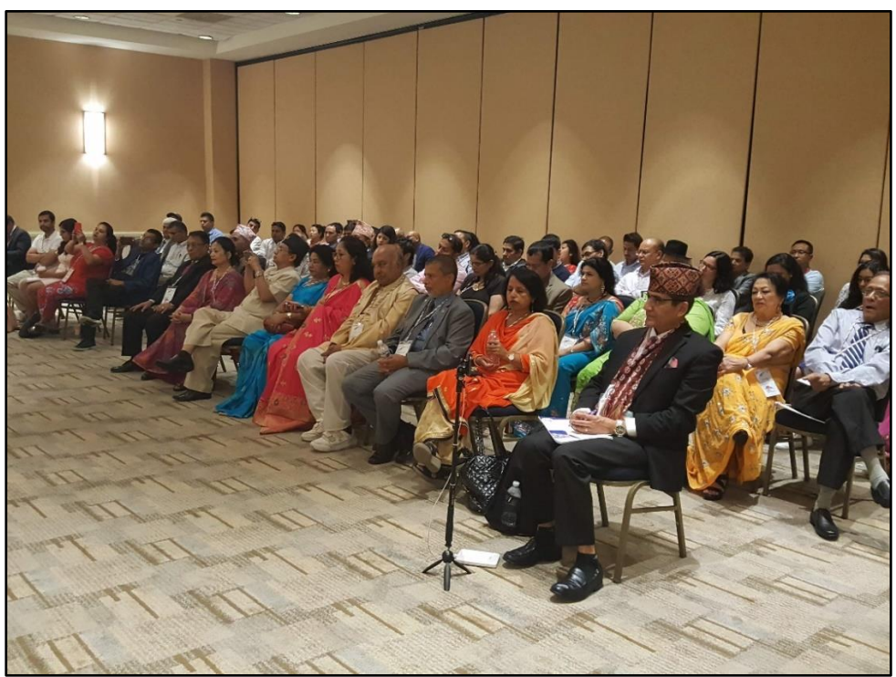
A View of Forum Attendees