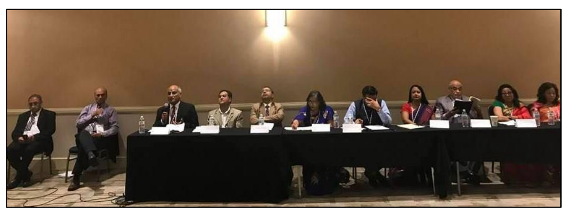
Forum Panelists and the two Moderators