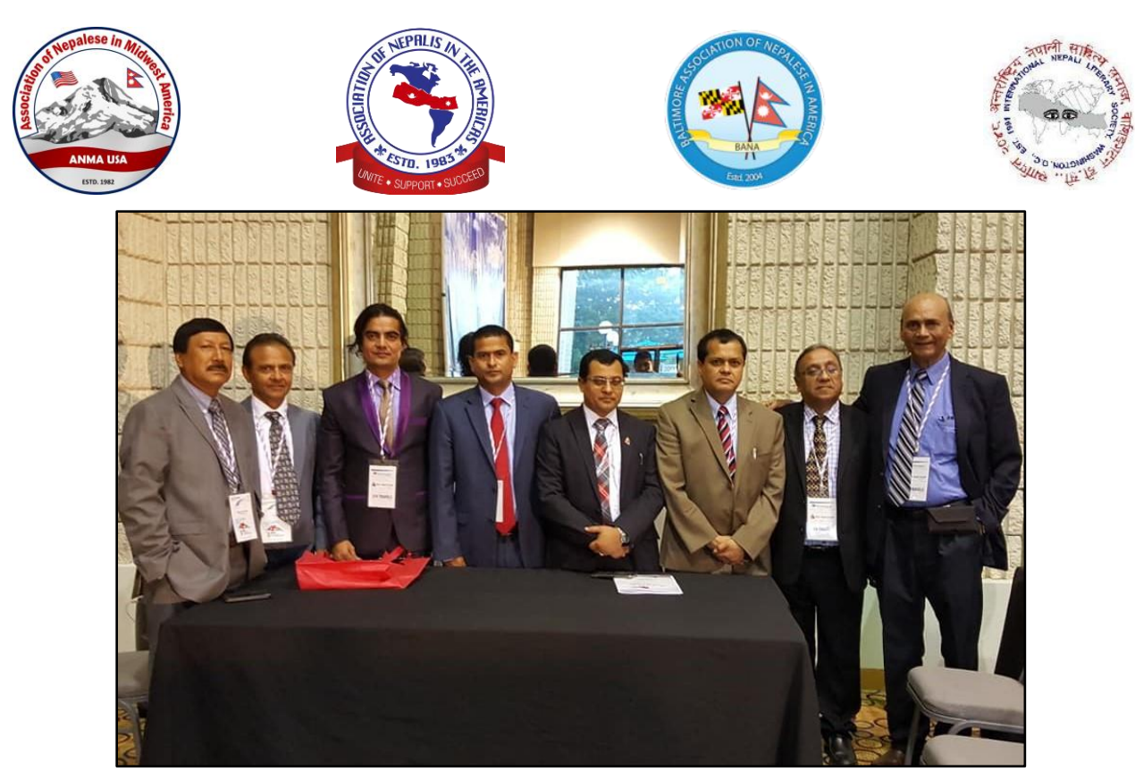
ANA Executive Members and Forum Moderators