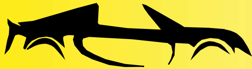
Old Julian Highway