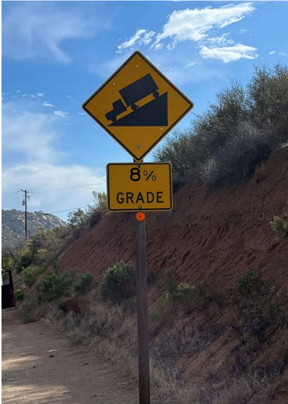
55.3 What's the grade?