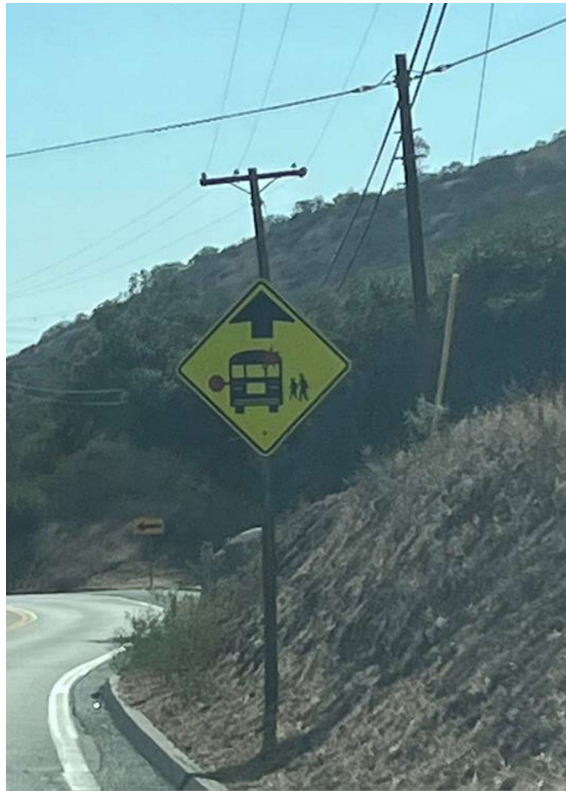
57.1 How many children?