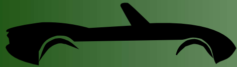
Route 78 East