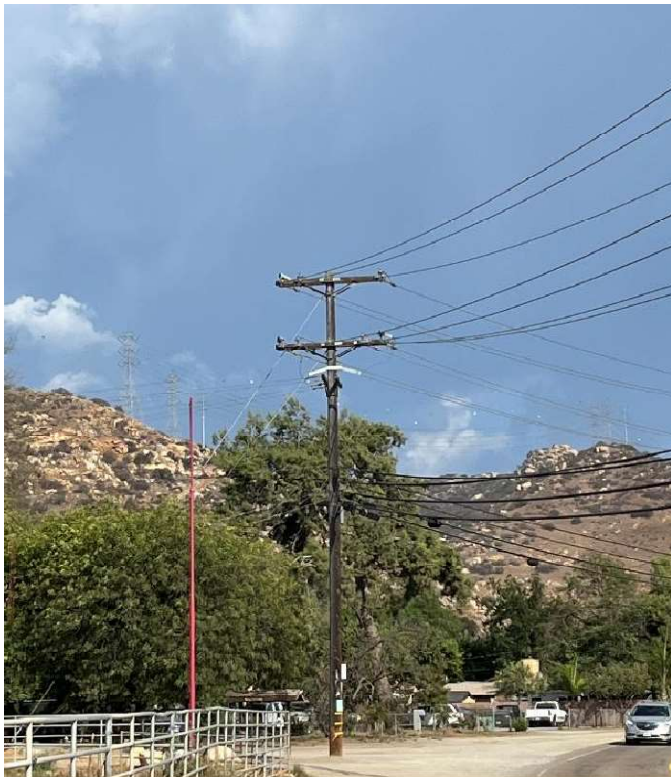
The answer was 49 warning balls on the high-tension wires but you had to look around and have good eyesight