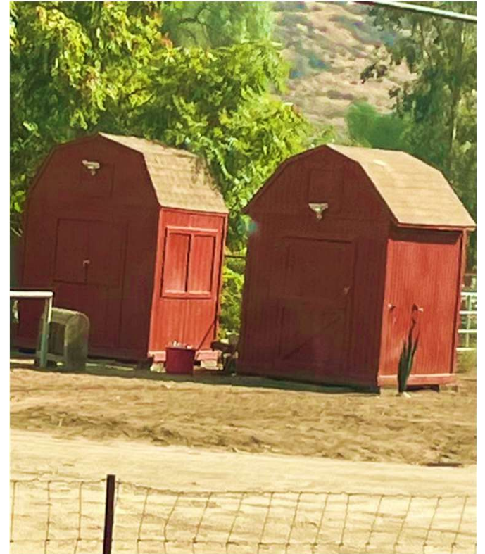
58.3 What color are the sheds?