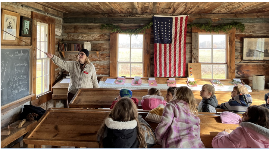
SJA students learn how school was different 100 years ago.