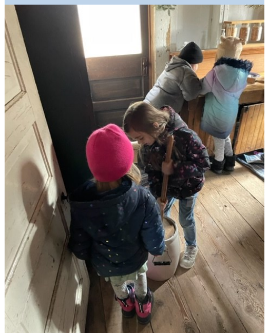
In December, students learned how butter used to be made while visiting the Chippewa Nature Center.